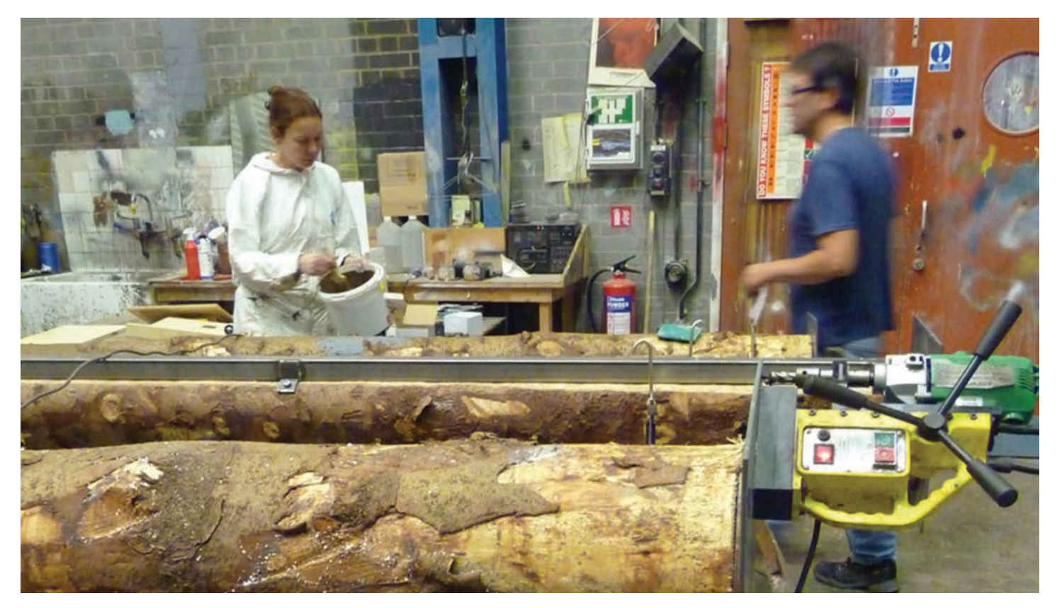
West Yorkshire Playhouse / As You Like It / Resource Pack

It was a bit difficult, because obviously we needed somebody who could provide us with cut trees, so the cutters must have either a forest or someone who can supply them. And also be able to do a bit of machine work on them for us as well. A few years ago we did a show in the Quarry called Proposals which was set on the edge of a forest and I managed to find a company in South Wales who do a lot of timber products, i.e. they do a lot of those kids playgrounds all made out of timber so they obviously had the facilities to machine timber down to create that sort of thing. But they also had their own forest – so when we did that show I contacted them and we actually bought from them some cut pieces of log in their natural state. What they do when they get them in their factory they strip all the bark off, and trim them down, and we obviously didn't want them with bark off we wanted with bark on, and they were willing to let us have them that waty. So that was the first time we used them, and I think we used them again on Wind in the Willows. I contacted them this time and they were still in business, which was lucky, and they were