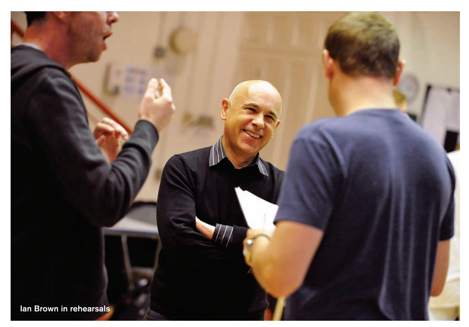
West Yorkshire Playhouse / As You Like It / Resource Pack

As I'm writing this, it's the Monday evening of Production Week – our fifth and final week of rehearsal. The trees that are a huge feature of this set have been put up during the day and I'm about to go and have a look at them. We've spent today working through particular moments of the play in Rehearsal Room One, and tomorrow we have our final run-through before saying goodbye to the rehearsal room and moving into the theatre for the technical and dress rehearsals – and, on Friday night, the first preview performance. It's an incredibly exciting time. As Jacques says in the play, 'all the world's a stage' – and we can't wait to bring the world of the Forest of Arden to the Quarry Theatre stage in a few days' time.