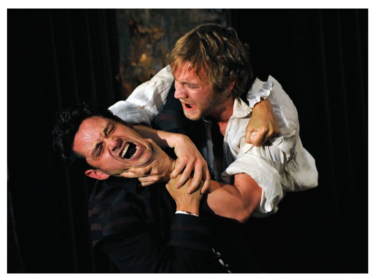
West Yorkshire Playhouse / As You Like It / Resource Pack

At university I studied English and Music at Cambridge and was involved in Footlights, the Cambridge drama society. I then went on to become a teacher and I taught in Nottingham for a number of years before returning to university to study acting at Rose Bruford. I now work regularly as an actor musician so for example in this play I perform as well as support the music elements of the show. The more skills you have as an actor the more saleable you are and if students reading this are thinking about going into this profession I would say that it's a good idea to think about developing additional skills which will make you of interest to a director.